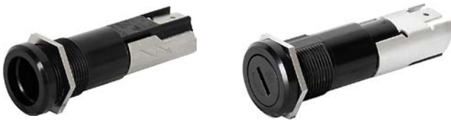
Socket without mounted Cap Caps must be ordered separately (see accessories)

FUL, Shock-Safe Fuseholder, 5 x 20 / 6.3 x 32 mm, Slotted Cap